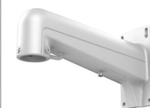
PW-002 long arm wall mount bracket